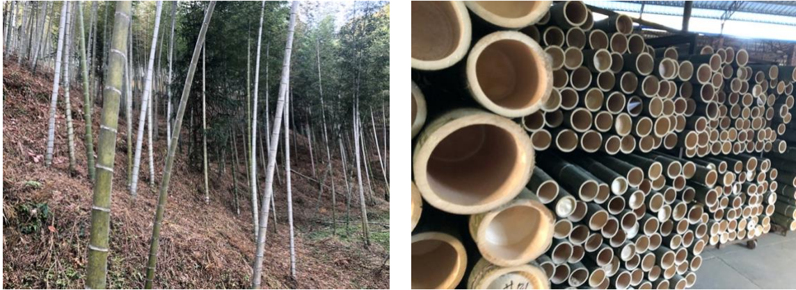
Figure 2 Bamboo culms and rough processing site near plantations

friendly. Bamboo used for construction purposes must be harvested when the culms reach their greatest strength and when the sugar level in the sap is at its lowest (usually when the bamboo culm is 3 to 5 years old), and afterwards it should be cured and dried properly for further treatment and manufacturing purpose. Harvesting is best taking place at the end of the dry season, and a few months prior to the start of the rainy season.